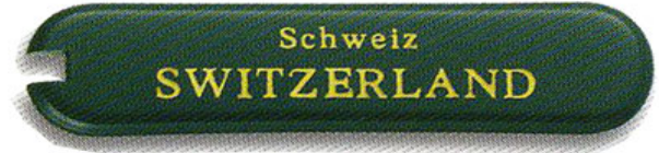
Times - small + large