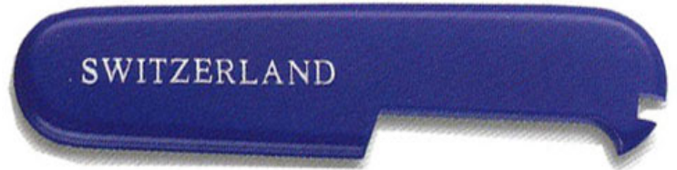
Times - Large