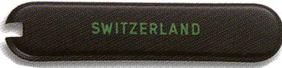
Helvetica - Condensed