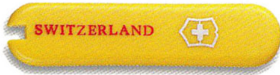
Times - Small